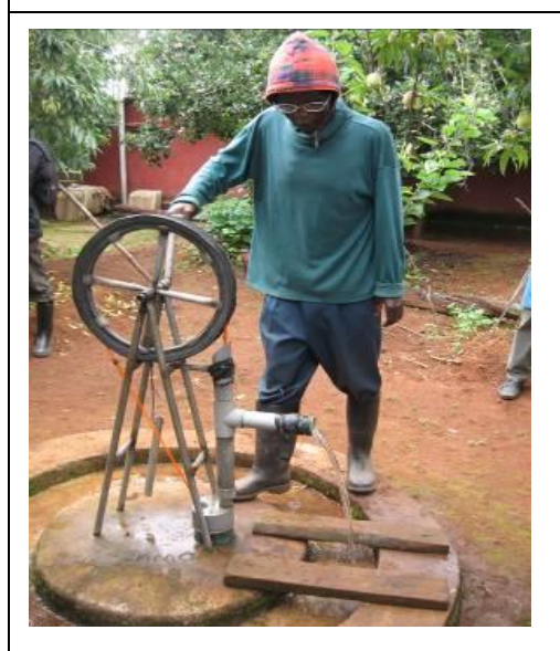
Photo 6. Now the same well has water all year round and is used for domestic use and garden irrigation