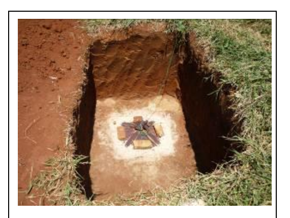
Photo 2. The hole is filled with gravel and covered by a sand filter that is then covered with a cloth filter. A rope is attached to the cloth filter to pull it up for cleaning