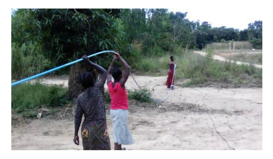
Photograph 1. Women removing the rising pipe to fix a broken rope. Communities are able to maintain the Rope pump on their own