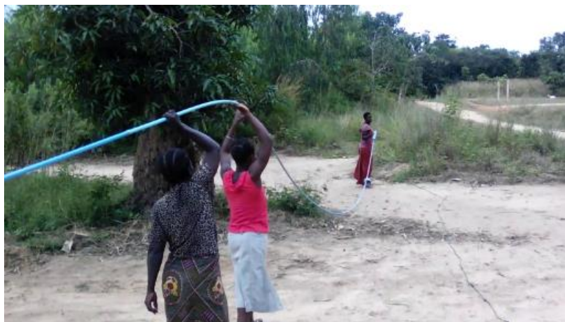
Photograph 1. Women removing the rising pipe to fix a broken rope. Communities are able to maintain the Rope pump on their own